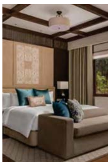
ANYA RESORT TAGAYTAY