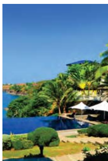
CLUB PUNTA FUEGO