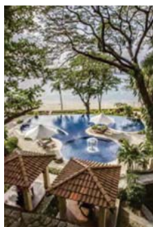
TERRAZAS DE PUNTA FUEGO