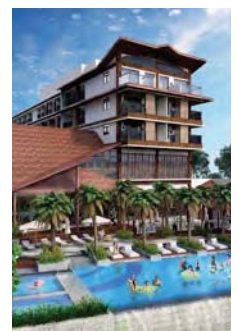
BRIO DE AGOHO